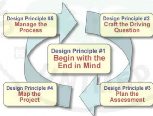
Figure 2. Project-based learning principles

Project-based learning (PBL) is a learning approach innovative approach to implementing various strategies that lead to improvement 21st century skills. PBL is a controlled learning approach by students through teacher assistance. In this case, students gain understanding through questions that can answer their curiosity [1]. Furthermore, [1] explains that students determine questions their own research is then guided by the teacher to conduct research, then the results of this project are presented to a determined audience previous. Bucks Institute of Education (BIE) Team in the book "Handbook of Project Based Learning" (2008) outlines 5 principles of based learning project as shown in the figure below: