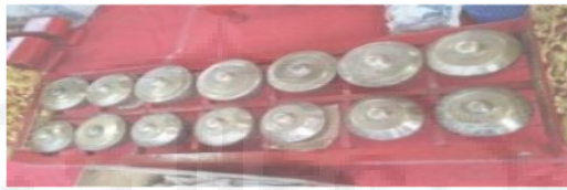
Figure 1. Bonang

Peirce refers to a 'genuine relation' between the 'sign' and the object which does not depend purely on 'the interpreting mind' (ibid., 2.92, 298). Index is a sign which refers to the object that it denotes by virtue of being really affected by that object (Winckler, 2011: 78).