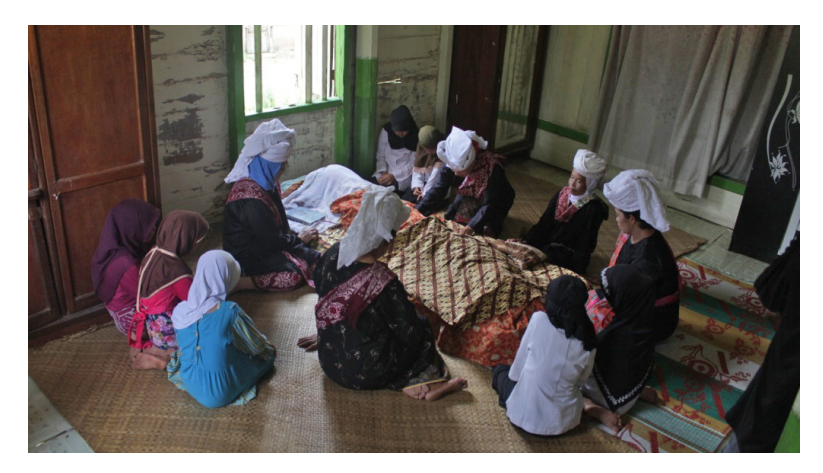
Figure 2. Bewailing on house roof