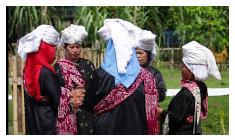
Figure 3. Bewailing in yard

The transformation that has happend to the ratok bawak ritual and turned it into a form of a show art, is an expression of the society's feeling that the partakers in the ratok bawak is entitled to become creative through his or her perception of sense and image. The feelings in ratok bawak relate to feelings of physic sensation, accusative, strong desire, stress, and strong emotions which are related to the life of the community in each region that practices the ratok bawak . The show art of the ratok bawak is not only depicted as a game that stands alone, but it also has a relation to the social life and cultural society and with cultural values in society. Besides that, there is also a relationship between the artists and the society, between the artists of ratok bawak artistic group and the tradition owners of the ratok bawak . The show art as an aspect of creativity is the ability of someone to use his/her ability to address the situation at hand. Art very relates to skill, human's activity, work of art, and aesthetics. Art is an expression of some feelings and human thinking. So, when someone wants to create