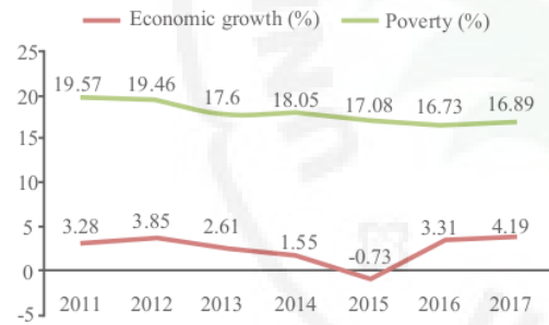
Figure 1. Economic growth and poverty in Aceh Province, 2011-2017