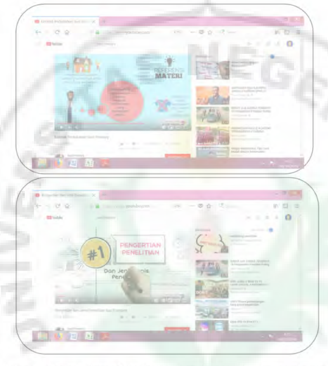
Figure 1. Some videos of the Powtoon application that have uploaded

IOP Conf. Series: Journal of Physics: Conf. Series 1188 (2019) 012108 doi:10.1088/1742-6596/1188/1/012108