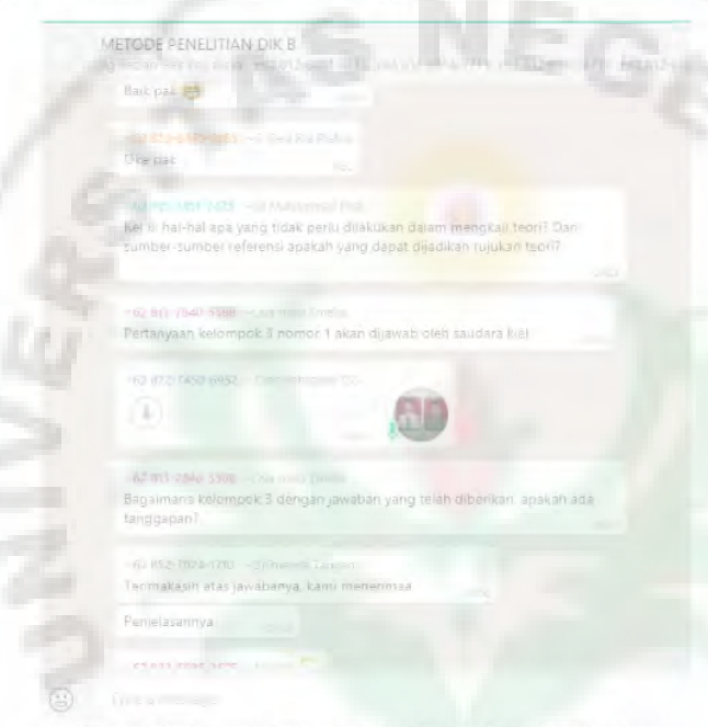
Figure 2. Learning through the WhatsApp Application

communication between the lecturer and the student goes well, students feel closer and more open to their lecturers so that students do not hesitate to ask if they encounter problems with understanding the material. The following is a discussion with WhatsApp.