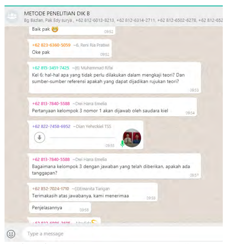
Figure 2. Learning through the WhatsApp Application

communication between the lecturer and the student goes well, students feel closer and more open to their lecturers so that students do not hesitate to ask if they encounter problems with understanding the material. The following is a discussion with WhatsApp.