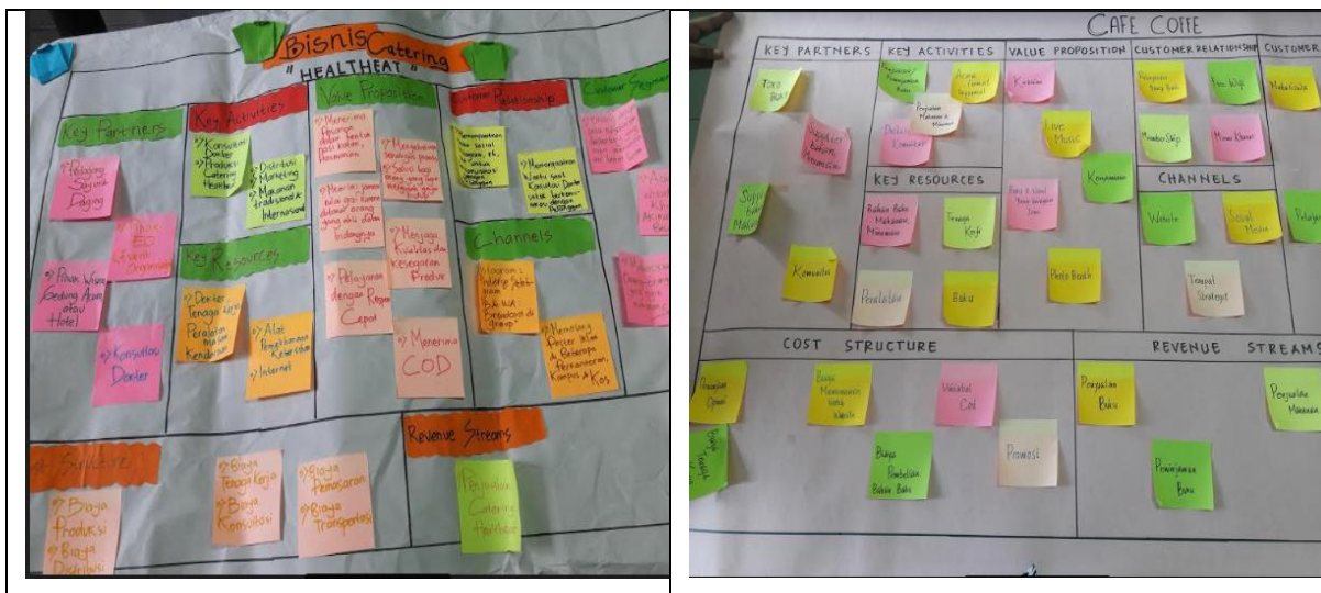
Figure 2 Examples of BMC Students' assignment

students in each group is relatively the same. This BMC entrepreneurial learning experience will be useful later if they build their businesses or work with others.