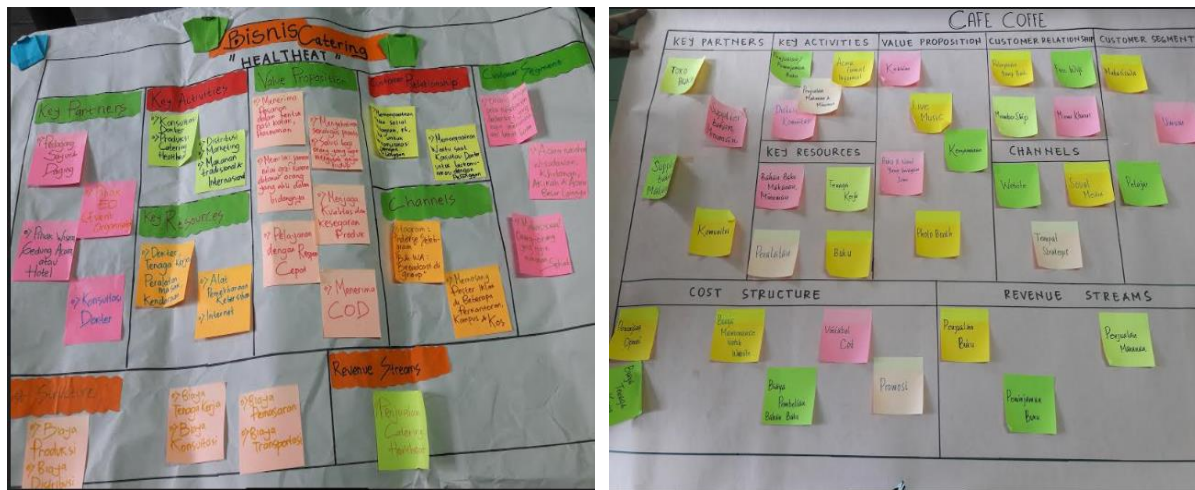
Figure 2. Examples of BMC Students' Assignment