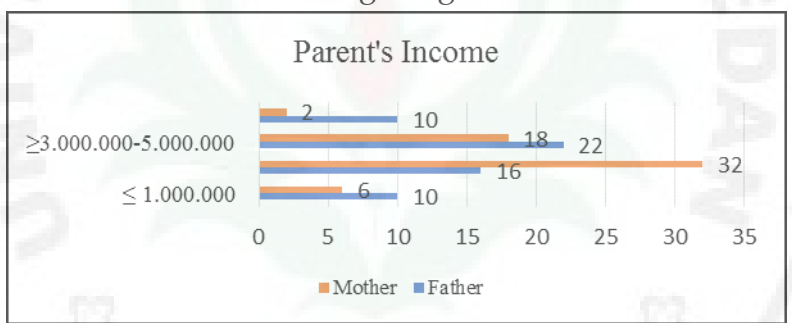
Graph 2. Graph of Parental Perception Questionnaire Value Based on Parental Income Level

Meanwhile, in the fishing community, it is very rare for their children to go to school and college. This inequality occurs allegedly because parents' awareness of children's education is still very minimal. In general, talking about awareness means that there is active action from parents. Thus, parents who are aware of the importance of children's formal education will definitely continue to strive to send their children to a high level. And this act is evidenced in sending their children to school. The relationship between parents' consciousness plays an active role in achieving the goals that children want.