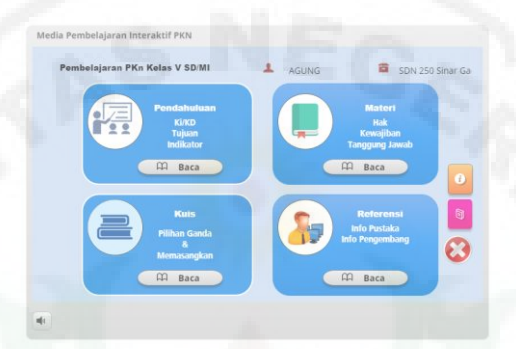
Fig. 3. The main menu of interactive learning media.

browsers such as Google Chrome, Mozilla Firefox, Opera Mini, and so on. This will open the media page. On the media page, there is a button to enter the login page to input student names and school origins. After that go to the instructions page, and there is a button to enter the main menu page as follows: