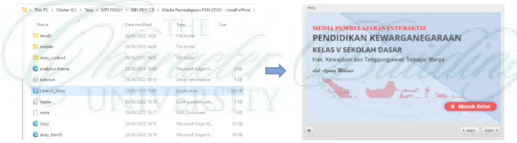
Fig. 2. media installation offline (ex).

The application of this interactive learning media can be used offline and online: Interactive learning media can be run offline on a computer (PC), laptop, Chromebook, or MacBook. Offline use by downloading files on <a href="https://bit.ly/MediaPKnCDoffline">https://bit.ly/MediaPKnCDoffline</a>. After the download is complete, double click on the "Launch_Story" file as shown in Figure 2 below: