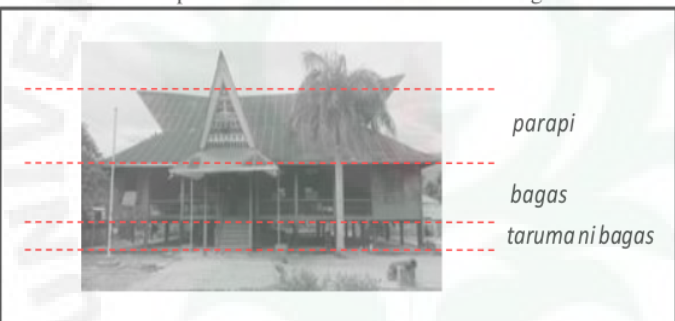
Figure 5: Mandailing people cosmology house

From structure and construction side, houses in Mandailing using house on stilts construction with wooden structure and natural stone as the ground. Vertically, the bouse divided into three parts that are parapi(upper world)as banuapartoru. Mandailing people had a belief that this universe is divided into three parts or called Banua, they are :BanuaParginjang (upper world), this is a place where God, the human master that called Datu Natumompa Tano Nagumorga Langit as the creator and the owner of this sky and earth; Banua Tonga (middle world), this is a place where human does daily life activities. This place is symbolized by red color; BanuaPartoru (bottom world), this is a place for dead people or called as spirit world. This place is symbolized by black color (Nuraini, 2011). The third parts centered in pantartonga (center room) is the room that considered holy, in this part made center pillar or tonga pillar. The construction shape of traditional house can seen in Figure 5