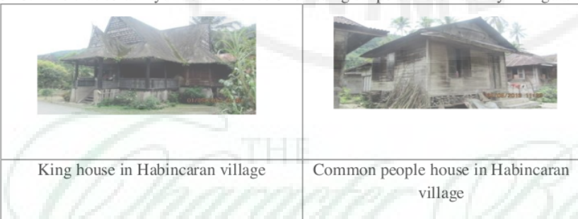
Figure 1 : The difference between king's house and common people's in Mandailing

The house shape in Mandailing different among king's house and common people's. The difference seen clearly from building mass, room size, room arrangement pattern, decoration style application, roof shape, and dimention. Generally, the king's house were in an area which is completed with yard (allamanbolak), rice barn (sopoeme), and custom building (sopogodang). Meanwhile, common people do not have that certainty. The difference of building shape can seen clearly in Figure 1-4