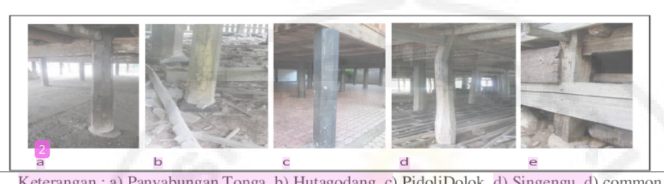
Keterangan: a) Panyabungan Tonga, b) Hutagodang, c) PidoliDolok, d) Singengu, d) common people's house foundation

IOP Conf. Series: M aterials Science and Engineering 128 (2016) 012016 doi:10.1088/1757-899X /128/1/012016 above the land. But, in some traditional house found the surface that had been permanent with make massive surface and had been made harden or cemented.