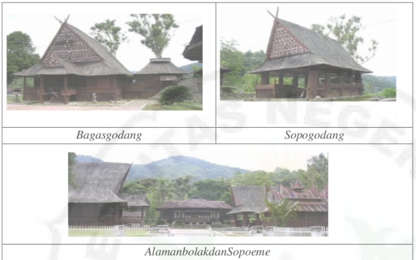
Figure 2 : Traditional house area in Hutagodang village – Mandailing.

International Conference on Innovation in Engineering and Vocational Education IOP Publishing IOP Conf. Series: Materials Science and Engineering 128(2016) 012016 doi:10.1088/1757-899X /128/1/012016