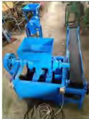
Fig. 2. Wood charcoal sawdust charcoal briquette molding machine.