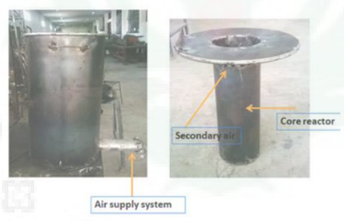
Fig. 2. The stoves prototype