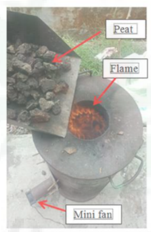
Fig. 3. The stove flame photoghrapic in operation

It was found that the peat with moderate diameter size (about 3 cm) was acchieved higher flame temperature about 680 ^{\circ} C with ER was about 0,34 during peak hour of the test run and than decrease. In this condition, the ability of the peat can also be observed through the colour of flame shown. This result is confirmed by the previews research through wood gasification in downdraft gasifier attain the higher Carbon monoxida and Methane content in the syngas on ER about 0,36[23].