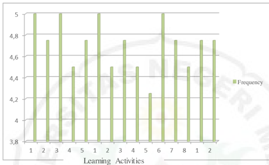
Figure 3. Value of Teacher Ability to Manage Learning