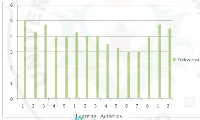
Figure 1. The Value of the Teacher's Ability to Manage Learning