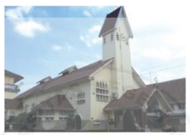
Fig. 6 Immaculate Conception of the Cathedral of Medan, 2019

In addition, Tjong also donated the construction of the Almashoem Grand Mosque (figure 7 below) and Gang Bengkok Mosque. The Almashoem Grand Mosque was built in 1906. Both mosques are places of worship for Islam. The construction cost of 75 percent comes from Tjong. He also assisted in the construction of the Maimoon Palace, the Deli Malay Sultanate Palace. Both of these buildings still stand majestically in the city of Medan. In honor of his generosity, in Kek Lok Temple located in Ayer Itam , Penang, stands with the magnificent statue of Tjong (Harahap, 2018).