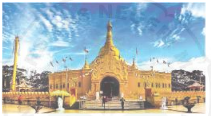
Fig. 10. Pagoda at Lumbini Natural Park, Brastagi 2018

Medan, or monasteries in Lumbini Natural Park, Brastagi, Karoland (figure 10 below). The Lumbini Natural Park is a Buddhist monastery that was inaugurated in 2010. The inauguration ceremony was attended by 1,300 monks and 200 lays from all over the world. The temple at Lumbini Natural Park is a replica of Shwedagon Pagoda in Yangon, Myanmar.