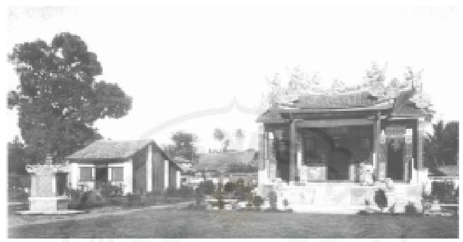
Fig. 4 Kwan Im temple at Labuhandeli, Medan 1890.