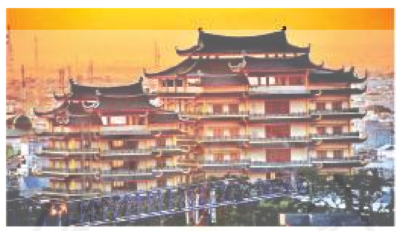
Fig 8. Setia Budhi monastery under reconstructions, Medan, 2018.

Maha Maitreya (figure 9 below) is a Buddhist monastery that was built in 1991 and an inauguration ceremony on August 21, 2008. The area reaches 4.5 hectares. Maha Maitreya Monastery has a capacity of 4,000 people. The monastery consisting of a Baktisala room to worship Sakyamuni Buddha, Bodhisattva, and the Bodhisattva Satyakalama Avolokitesvara. In addition, this complex has a Baktisala Holy Patriarch, a guest house in one building that has the most complete facilities, namely the existence of office space, meeting rooms, recording studios, and a communal kitchen.