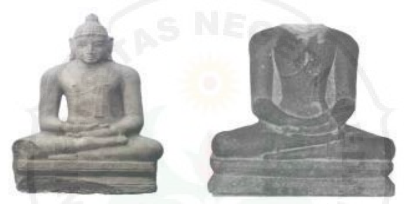
Fig. 2 and 3 Buddha sculpture from Kota Cina, Medan.

the Netherlands recorded the name of this region is 'Kota Tjina' (city of China) which refers to findings originating from China. The discovery of the Buddha statue (figure 2 and 3 below) is still complete (base, 43 cm x 38 cm; h. 86 cm), made of white granite and seated Buddha image, wearing a robe, hand gesture describing 'dhyānamudrā's, right hand placed on the palm of the left hand.