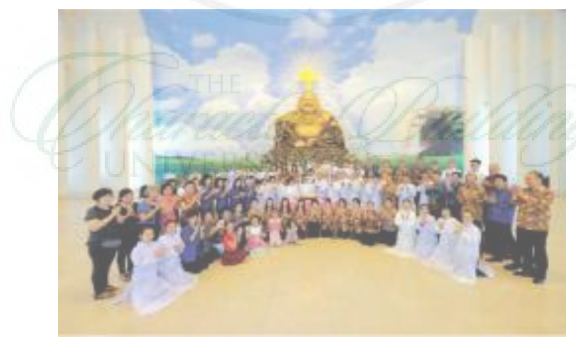
Fig 9. Buddha worships at Maha Maitreya Monastery, Medan 2018

Maha Maitreya (figure 9 below) is a Buddhist monastery that was built in 1991 and an inauguration ceremony on August 21, 2008. The area reaches 4.5 hectares. Maha Maitreya Monastery has a capacity of 4,000 people. The monastery consisting of a Baktisala room to worship Sakyamuni Buddha, Bodhisattva, and the Bodhisattva Satyakalama Avolokitesvara. In addition, this complex has a Baktisala Holy Patriarch, a guest house in one building that has the most complete facilities, namely the existence of office space, meeting rooms, recording studios, and a communal kitchen.