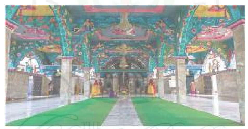
Fig. 5 Interior of Hindu Shri Mariamman temple at Medan, 2018.

Tjong also donated to the construction and renovation of the Catholic Church on Jalan (street) Pemuda Medan (figure 6 below). The architect of this building is J.M. Hans Groenewegen, a popular architect from the Netherlands. The same donation was given to the construction of the Protestant church on Jalan (streets) Sugiapranata. Both of these buildings became houses of worship for Protestants and Catholics in Medan. Until now, these two buildings still stand majestically in the city of Medan.