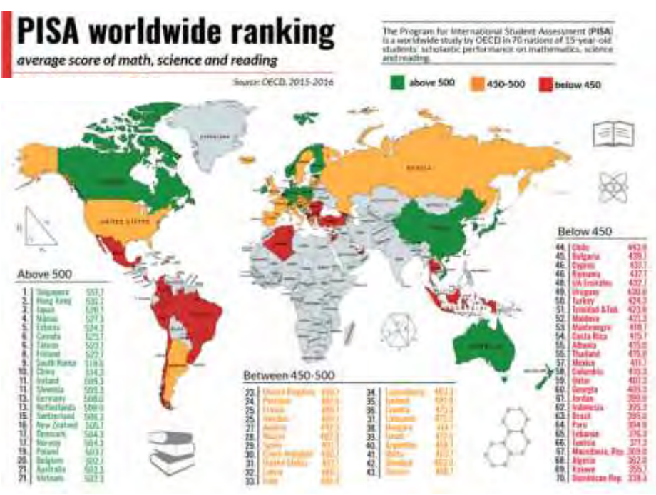
Figure 2.PISA worldwide ranking from 2015 – 2016.

The latest Human Development Index (HDI) shows Indonesia ranked 121st out of 185 countries, with an HDI of .629 that means Indonesia is ranked lower than two of its neighbouring ASEAN countries, Malaysia (64th) and Singapore (18th) [8]. The average score for the region was 0.683 [9]. To increasing the rate of HDI and GDP incomes, Indonesia is necessary to prioritize the acceleration of the development of the educational system [10]. Reaching the goal of the accelerating development on the educational system implies an international standard in the worldwide study, also known as PISA. The Program for International Student Assessment (PISA) deducted by The Organisation for Economic Co-operation and Development (OECD) in more than 70 nations of students [11]. Indonesian educational system adopts PISA to evaluate students' knowledge and skill.