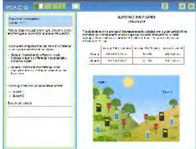
Fig. 2. Try out a selection of PISA 2015 science questions. Have a go at answering PISA 2015 questions to discover their level of difficulty and the concepts being tested.