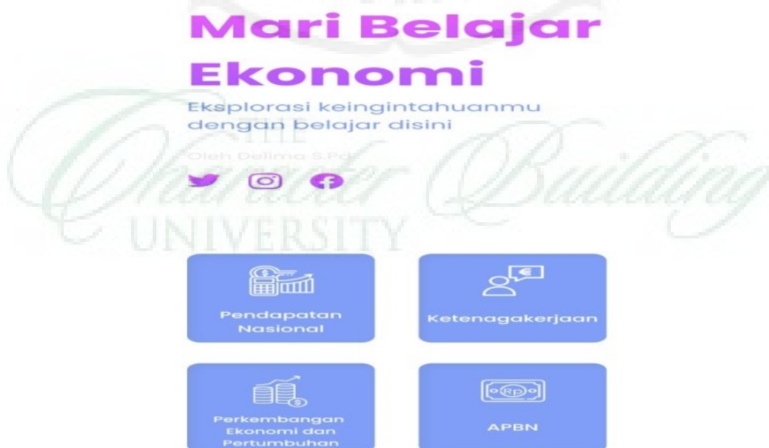
Figure 3. The first page in mobile form