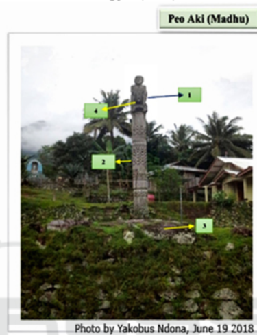
Figure 1: Peo Aki or Madhu. Peo aki has four basic elements, namely pu'u Peo or Peo's base (number 3), toko Peo or Peo's pole (number 2), and ana jeo or the statue of naked man (number 1), with male genital (number 4).

base of the branch that describes the female genitalia, and earrings (uli wolo) on the East and West sides of the base branch, which emphasizes the feminism of Peo fai. On every side of the base of Peo fai, there are carvings of stars and earthly creatures (scales, centipedes, lizards and crocodiles). On the back of both branches, there are carvings of the palm leaves, and on the top of every branch, there is a statue of a magpie (koka).