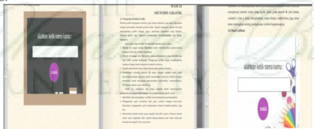
Figure 3. Digital-based interactive evaluation

Each chapter of the digital book is equipped with at least one video and animation showing problems and explanation of the concepts. In order to the abstract concepts become more real and easier to understand.