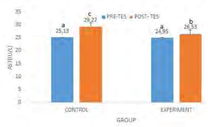
Figure 1. Pre and Post-Test Change of AST (mean±SD)

Figure 2 showed the ALT levels of the control group and the experimental group increased significantly (p = 0.000). The control group increased by 13.77 %, while the experime 2al group increased by 7.69 %. Statistical test results using the independent t-test showed that there were significant differences between the control group and the experimental group ALT levels post-test (p = 0.000).