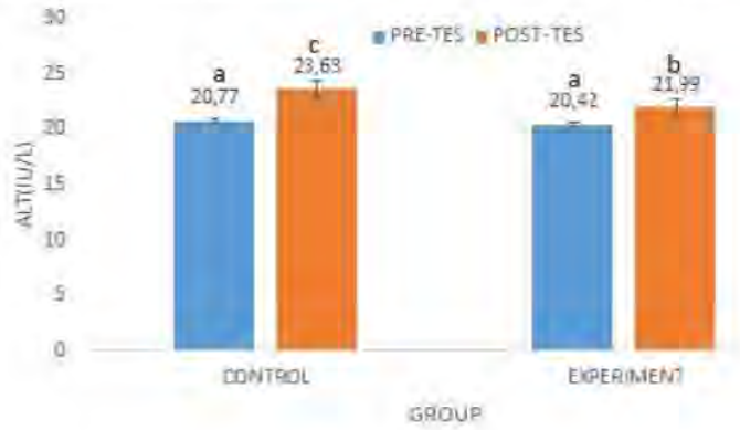
Figure 2. Pre and Post-Test Change of ALT (mean±SD)

Figure 2 showed the ALT levels of the control group and the experimental group increased significantly (p = 0.000). The control group increased by 13.77 %, while the experime 2al group increased by 7.69 %. Statistical test results using the independent t-test showed that there were significant differences between the control group and the experimental group ALT levels post-test (p = 0.000).