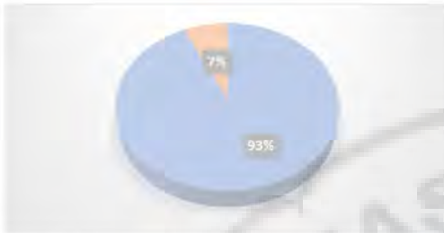
Figure 2 Percentage use the Internet as a learning support.

The percentage above shows that more and even the majority of students use the internet in finding learning resources. In today's digital era, the internet is the main source of learning. Students use the internet more to find reference sources.