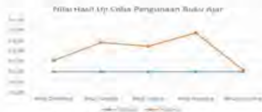
Fig. 2. Test Result Values for Using Textbooks

From the data table above it was seen that the results of pretests football skills of N:60 dribbling amounting to 1016.95 Mean of 16.95 and SD 0.82, passing by 1121.00 Mean of 18.68 and SD 4.07 and others also follow. And results of pretests and posttest football skills can be seen in the appendix.