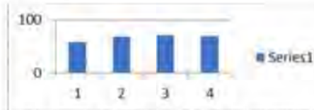
Fig. 6. Percentage of teacher social indicators (trainers) results

Based on the diagram above it can be explained that each question has a percentage where each item is an item in the table 4.6 questions 5 have a score of 17 results with a percentage of 85%, question no 6 has a score of 12 results with a percentage of 60%, question no 7 has a score of 17 with a percentage of 85%, question no 8 has a score of 17 results with a percentage of 85%.