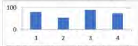
Fig. 2. Percentage of the principal's social indicators results.

Based on the diagram above it can be explained that each question has a percentage where each item is an item in the table 4.1 questions 1 have a score of 18 with a percentage of 90%, item no 2 has a score of 17 results with a percentage of 85%, item no 3 has a score of 17 with a percentage of 85%, question no 4 has a score of 16 with a percentage of 80%.