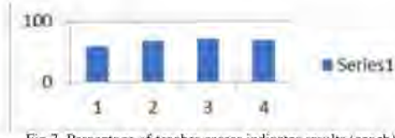
Fig. 7. Percentage of teacher career indicator results (coach)

Based on the diagram above it can be explained that each question has a percentage where each item is an item in the table 4.7 questions 9 has a score of 12 results with a percentage of 60%, item no 10 has a score of 10 with a percentage of 50%, question no 11 has a score of 16 with a percentage of 80%, question no 12 has a score of 15 with a percentage of 75%.