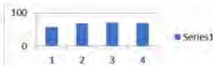
Fig. 10. Percentage of students' recreational indicators (athletes) results

Based on the diagram above it can be explained that each question has a percentage where each item is an item in the table 4.15 questions 5 have a score of 47 results with a percentage of 78%, item no 6 has a score of 44 with a percentage of 73%, item no 7 has a score of 50 with a percentage of 83%, question no 8 has a score of 54 with a percentage of 90%.