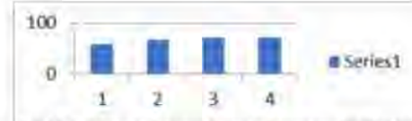
Fig. 11. Percentage of student career indicator results (athletes)

Based on the diagram above it can be explained that each question has a percentage where each item is an item in the table 4.15 questions 9 has a score of 32 results with a percentage of 53%, question no 10 has a score of 36 results with a percentage of 60%, question no 11 has a score of 31 with a percentage of 61%, question no 12 has a score of 39 results with a percentage of 65%.