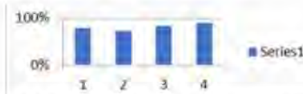
Fig. 9. Percentage of student social indicator results (athletes)

item no 3 has a score of 51 with a percentage of 85%, question no 4 has a score of 42 with a percentage of 70%.