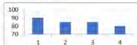
Fig. 1. Percentage of the headmaster's enrichment / enrichment

Based on the results of research conducted in the city of Padangsidimpuan City High School equivalent to 4 headmasters consisting of Padangsidimpuan Public High School 1, Padangsidimpuan Public High School 5, Padangsidimpuan Public High School 8 and Harapan Padangsidimpuan Private High School. Data from the stages of coaching in high school equivalent for headmasters there are two (2) indicators, namely 1. Development / questioning, 2. Social, 3. Recreational, 4. Career. The following are the results of answers from the school coconut, physical education teacher (trainer) and students.