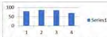
Fig. 8. Percentage of results of development / enrichment indicators

Based on the diagram above it can be explained that each question has a percentage where each item is an item in the table 4.8 questions 13 has a score of 13 results with a percentage of 65%, item no 14 has a score of 10 with a percentage of 50%, question no 15 has a score of 11 with a percentage of 55%, question no 16 has a score of 12 with a percentage of 60%.