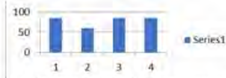
Fig. 5. Percentage of teacher social indicators (trainers) results

Based on the diagram above it can be explained that each question has a percentage where each item is an item in the table 4.12 questions 1 have an outcome score of 18 with a percentage of 90%, item no 12 has a score of 17 results with a percentage of 85%, item no 3 has a score of 16 with a percentage of 80%, question no 4 has a score of 18 with a percentage of 90%.