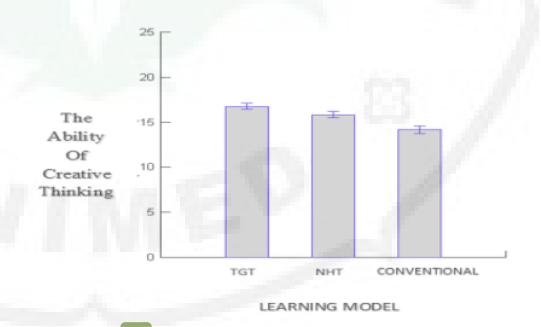
Figure 2 Differences in Creative Thinking Ability of Students Taught with TGT, NHT, and Conventional Learning

(2) Contribution of thoughts and reference material for teachers, prospective teachers, managers, developers, educational institutions and further researchers who wish to examine in more depth the results of using the TGT model with the NHT strategy and student creative thinking at 10 s effect on student learning outcomes. The difference in students' creative thinking abilities taught by TGT, NHT, and conventional learning can be seen in Figure 2.