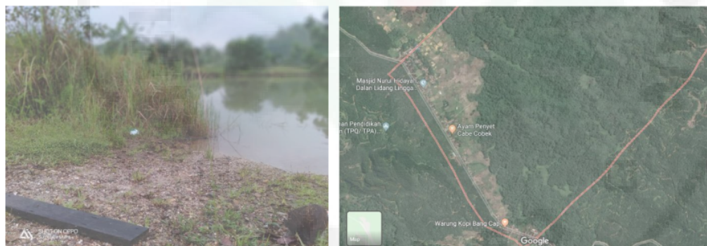
Figure 1. the location of the former gold mine in Mandailing Natal, North Sumatra Province of Indonesia

Soil samples were obtained from the location of the former community gold mine in the Mandailing Natal area of the North Sumatra province of Indonesia. At this location, the community left the gold mining area without making land improvements.