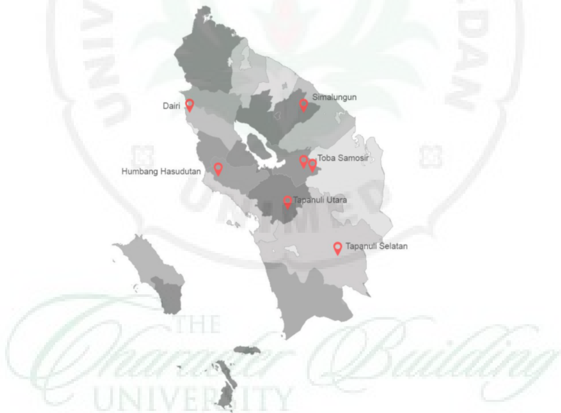
Figure 1: Sampling locations in North Sumatra, Indonesia at seven points in six regencies.

Z. acanthopodium plant sample is obtained from various regions in North Sumatra province which are represented by six regions namely South Tapanuli, North Tapanuli, Humbang Hasudutan, Dairi, Simalungun and Toba Samosir (Fig. 1). The samples used in this research are fresh leaf samples obtained by field exploration. The outgroup used to compare the barcoding sequences obtained were Citrus x paradisi and Melicope glabra , while the ingroup used were several species from the genus Zanthoxylum (Table 1).