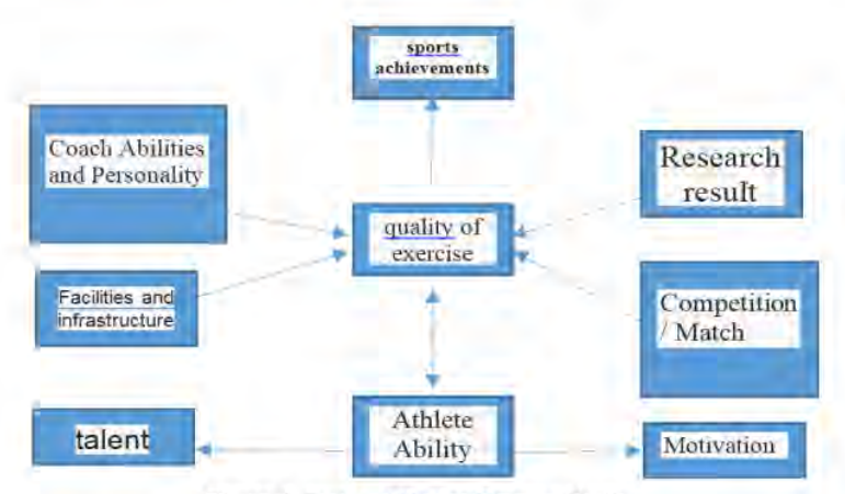
Figure 1. Factors Affecting Exercise Quality