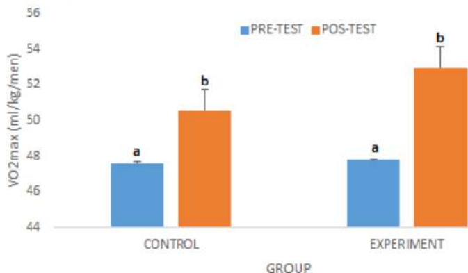
Figure 3. Impact of supplementation with BRJ on VO 2 max. In each group, the mean ± SD is mean ± SD for n=15. Different letters suggest a significant difference between paired t-test samples at p < 0.05

6 Figure 3 shows that beetroots juice administration during exercise can increase VO 2 max compared to the control group. This increase in VO 2 max occurs due to nitrate content and antioxidant content possessed by beetroots. The results showed 500 ml of beetroot juice containing nitrates as much as 5.1-6.2 mmol (Bailey et al., 2009; Lansley et al., 2011). Beet tubers have been shown to affect pulmonary oxygen uptake (VO 2 ). The results of the study on the consumption of inorganic nitrate (5.1 mmol nitrate/day) in the form of 500 ml beet juice for six days in 7 adult men (19-38 years), can reduce lung oxygen uptake (VO 2 ) at exercise intensity so that it can delay fatigue time (Bailey et al., 2010).