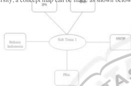
Fig 2. forming a concept map

main concepts to be taught and arranging them systematically and linking one concept to other relevant concepts and finally forming a concept map. For the theme of the Beauty of My Diversity, a concept map can be made as shown below: