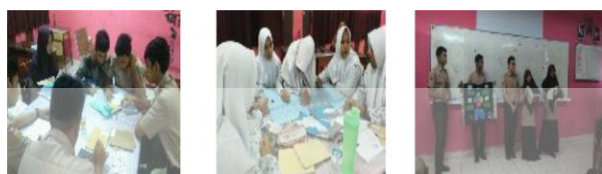
(i) (ii) (iii)

Figure 2. The implementation of pop-up on colloids: (i) students observed the pop-up, (ii) the group work prepared the presentation materials, and (iii), students presented the results of group