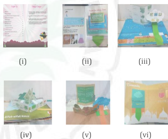
Figure 1. Developed Innovative Pop-up Book: (i) Table of content, (ii) page of colloidal definition, (iii) page of the colloidal types, (iv) page of colloidal properties, (v) the role of colloids page, and (vi) the conclusion page

c) The development of assessment instruments. The validation of pop-up book was assessed using questionnaire sheet and the students' activities were assessed using observation form. d) Validation of pop-up book. Validation aimed to assess the feasibility of the pop-up book. The feasibility of pop-up book on colloids material obtained from the expert validators. Based on the results