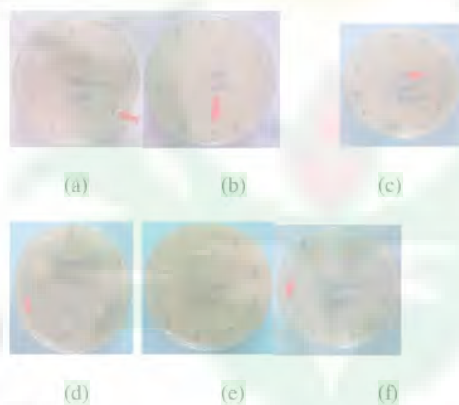
Fig. 2.MBC test results: (a) Chloramphenicol; (b) Sidaguri extract against S.aureus bacteria; (c) Chloramphenicol; (d) Sidaguri extract against E.faecalis ; (e) Chloramphenicol; (f) Sidaguri extract against S.mutans .

S. rhombifolia L. al contained tannins and saponins (Wake et al, 2013; Heinichen et al. 2017; Azad et al.2017). The mechanism of action of saponins was included in the antibacterial group which disrupts the permeability of bacterial cell membranes, which results in damage to cell membranes. It could be caused the release of various important components in bacterial cells namely: proteins, nucleic acids and nucleotides Based on research (Nurhidayat et al. 2012).The mechanism of the action of tannin as an antibacterial by causing the cell would become lysis (Ngajow et al, 2012).