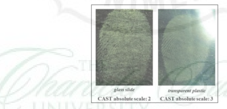
FIGURE 2. Representative photographs of visualised fingerprints on glass slide and transparent plastic using gambir powder (0.250mm).

To investigate the effect of the gambir powder size on the quality of visualised fingerprints on dry, non-porous surfaces, the gambir powder was first sieved using 0.250mm (60), 0.177mm (80), 0.149mm (100) and 0.125mm (120) sieves. Results revealed that the quality of visualised fingerprints on glass slides and transparent plastics using 0.250mm sieve appeared better compared to the quality of visualised fingerprints using gambir 3 yder of particle sizes 0.177mm, 0.149mm and 0.125mm. W 2 e CAST absolute scale of 2 can be defined as 'less than 1/3 clear ridge detail', scale of 3 can be designated as 'between 1/3 and 2/3 clear ridge detail' [13]. Such an observation suggested that relatively coarse gambir powder were best applied for surfaces like glass slides and transparent plastics. In addition, the lower quality of visualised fingerprints on glass slides (CAST absolute scale: 2) when compared to that of transparent plastics (CAST absolute scale: 3) may be attributable to the glassy and relatively smooth surface of glass, hence resulting in weaker adherence of sebum-rich fingerprint constituents onto the surface which subsequently had affected the attachment of gambir powder. Representative photographs of visualised fingerprints on both glass slide and transparent plastic using gambir powder of particle size 0.250mm are shown in Figure 2.