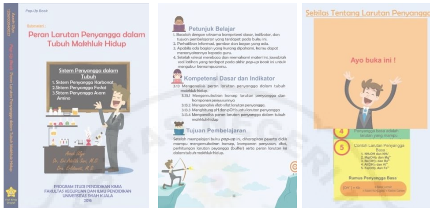
Figure 1. The Design of Pop Up Book