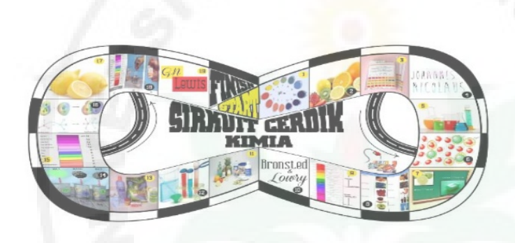
Figure 1. The preliminary design of ingenious circuit board game.

Design Phase. At this stage, the design of the product was made, the product produced in the form of chemical instructional ingenious circuit of colloids. Colloidal material was one of learning materials chemistry at the high school level classes XI 2<sup>nd</sup> semester circuits Games ingenious in design by modifying the monopoly and snakes and ladders game that we had been know daily life. This learning media was designed so that attract students to enjoyable learning. At this stage, designed some of the components required in the learning media such as media board, pawns to play, and a set of game cards (card proprietary questions, trap cards and card points). The preliminary design of ingenious circuit board games can be seen in Fig.1.