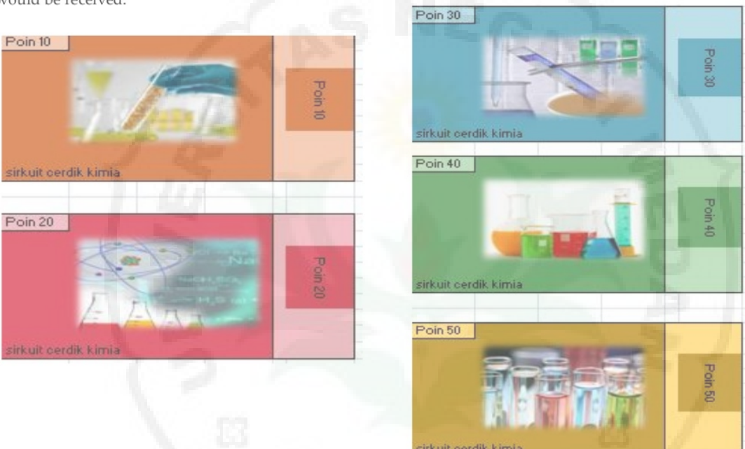
Figure 5. Point Cards

The point cards as shown in Fig. 5 were the cards which replacement of fake money as commonly found in a monopoly game. In addition the point cards would be get when students were able to answer the questions from the question cards and trap cards. When the student had passed the star box, the point cards would be received.