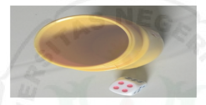
Figure 5. Dice and Shuffle

This game provided 1 (one) dice and 1 (one) shuffle. The dice were slightly larger than the dice which used in monopoly game. Fig. 7 shows dice and shuffle used to play.