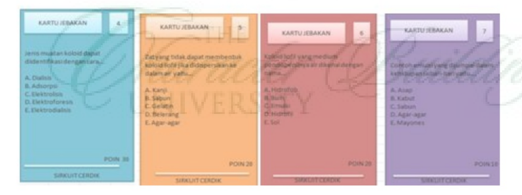
Figure 3. Trap Cards

Trap card was a replacement of the card, where tricky question was taken at one point stopping place or the ground was already owned by another group. This card was designed to add excitement to the game, so the game was not too monotonous. This card was consisted of 15 pieces of cards and shown in Fig. 4.