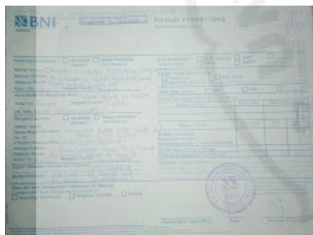
Moondra Zubir (OJC12691-18).jpeg 49K