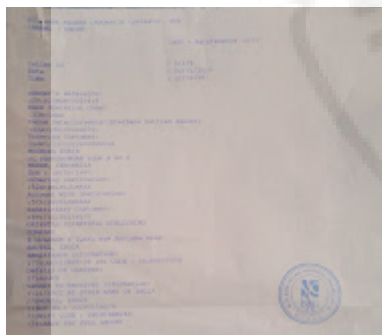
Payment-2 (OJC-12606-18).jpg 129K