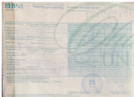
Payment-1 (OJC-12606-18).jpg 457K