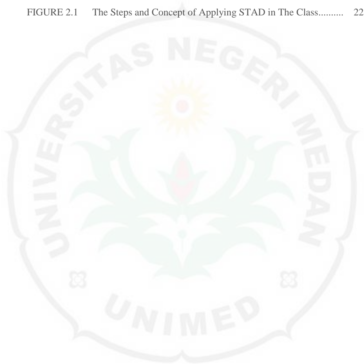
FIGURE 2.1 The Steps and Concept of Applying STAD in The Class..... 22