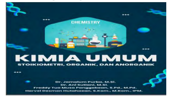
Figure 2. E-Learning-Based General Chemistry Book

The product developed in this study is e-learning on computer-based test (CBT) General Chemistry learning organic material. CBT-based e-learning is prepared and developed with the aim of facilitating lecturers and students in the learning process of General Chemistry on organic matter and is expected to assist lecturers in conducting diagnostic tests and in making academic policies for students. The products produced and have been declared feasible by expert validators are then applied to students to analyze the effectiveness of the products produced.