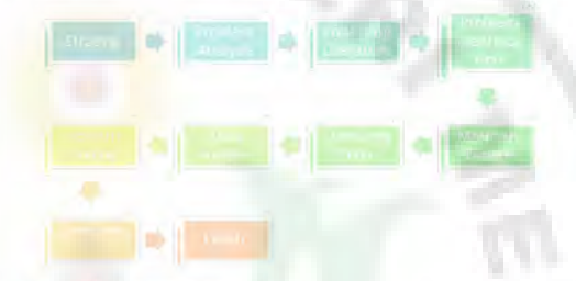
Figure 1 Research Flowchart.

To achieve the expected objectives, this type of research was designed using a descriptive qualitative approach to obtain the portrait of Center of Laboratory Project (CoLaP) needs analysis in learning. The design of CoLaP analysis in learning is as follows: