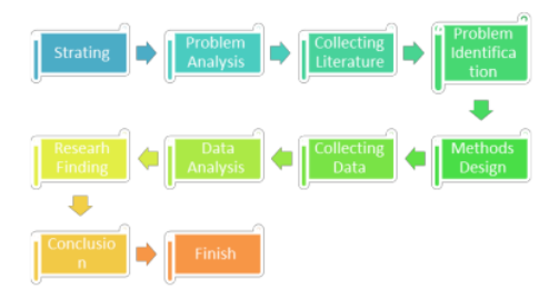
Figure 1 Research Flowchart.

4 To achieve the expected objectives, this type of research was designed using a descriptive qualitative approach to obtain the portrait of Center of Laboratory Project (CoLaP) needs analysis in learning. The design of CoLaP analysis in learning is as follows: