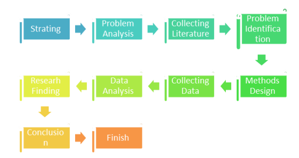
Figure 1 Research Flowchart.

To achieve the expected objectives, this type of research was designed using a descriptive qualitative approach to obtain the portrait of Center of Laboratory Project (CoLaP) needs analysis in learning. The design of CoLaP analysis in learning is as follows: