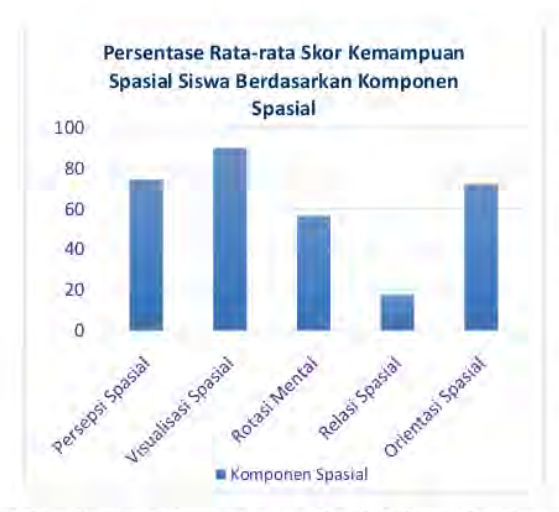
Figure 1. Diagram Persentese average Spatial Ability Students Score Based on Spatial Capabilities Component