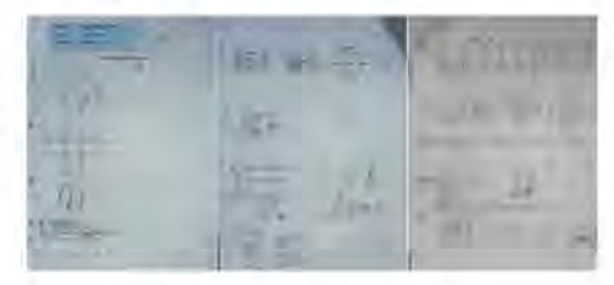
Figure 5. Results Answer Student S-22

From the results of an interview on Question 2, I found that the way of thinking of S-15 and S-22 there is a difference, where students S-15 in the counting was not smart enough while students S-22, still no effort to be able to resolve the issue though constrained because of time. Both students can understand a problem and connect it to the surrounding objects that are used as a tool. Only S-22 students need the help of friends. Also, both can analyze a wake room if the room woke played with 90° and can be positioned wake of a room at a different angle after the swivel 90°. Working result matter by the students coded S-22, in Figure 5 as follows: