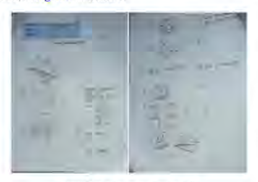
Figure 7. Results Answer Student S-26

From the results of an interview on Question 3, the S-26 students where students S-26 also was able to visualize the image of the form webs into a box shape that is perfect as S-8 students. Also, the S-26 students can determine the position of each side of the box from a different part of both front, rear, right, left, up and down. Only on the spatial relationship of S-26 students can not solve the problem because there is pretty good at counting but still no attempt to resolve the problem by considering the way of solving the same problem. Students S-26 is not at all good at dreaming up a position wake the room if the room woke played with 360°, 270° and 90° different thing with S-8 students who still can fantasize geometrical position if played 360°. Working result matter by the students coded S-26, in Figure 7 as follows: