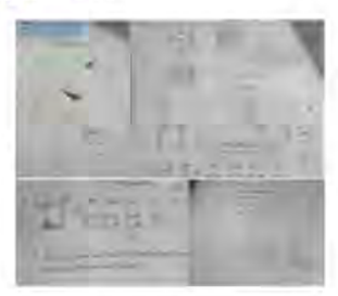
Figure 2. Results Answer Student S-4

Working result matter by the students coded S-4 as follows in Figure 2 below: