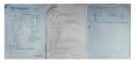
Figure 6. Results Answer Student S-8

Subject to the student code S-8 and S-26 is a subject that has a low spatial ability test results. Interview excerpt presented as follows. Working result matter by the students coded S-8 in Figure 6 as follows: