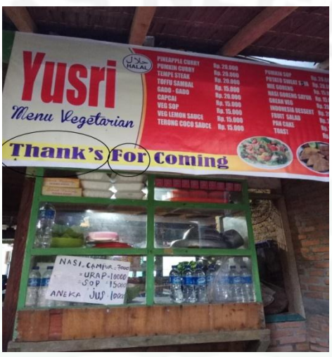
Picture 1.4 The primary data for unnatural translation in Bukit Lawang

Here is another example of unnatural translation gotten from public signs in Bukit Lawang