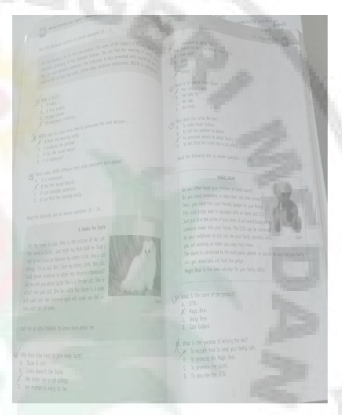
Figure 1.1. The pictures of descriptive's exercises.