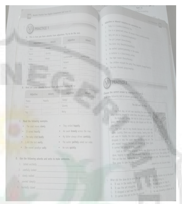
Figure. 1.3 . The figures of narrative's exercises.

The pictures above show that the exercises in the worksheet about the genre of text that support the students' ability in understanding about the text were not enough because the exercises that put on the worksheet there was not about the exercise that support the students' ability about the text itself such as the questions that aim to determine of the generic structure and language features of the texts.