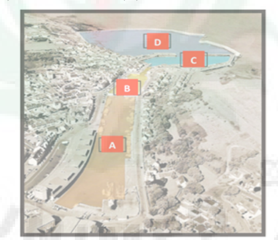
Figure 1. Location of material sampling (Port en Bessin)

The MDS used in this study was collected from Port en Bessin. The harbour Port-en-Bessin (PEB) is located in the West of France. The sediments dredged from four different, Bassin no.1 (A, see figure 1), Bassin no.2. (B), Avant Port 1 (C) and Avant Port 2 (D).